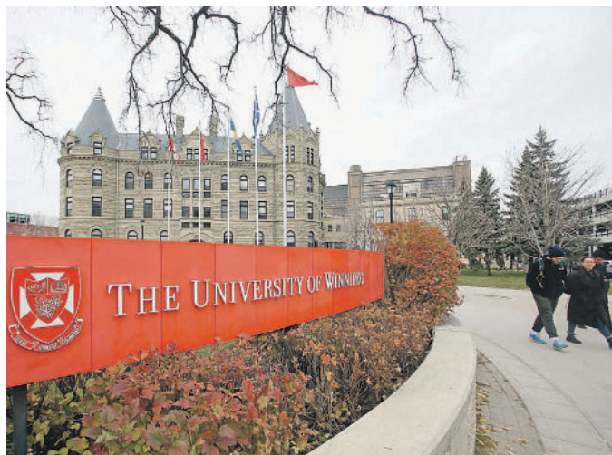
The scholarship will be awarded to a female student at the University of Winnipeg with a good academic record and an interest in leadership in their chosen field.

It was not an easy time. During her tenure, the city experienced